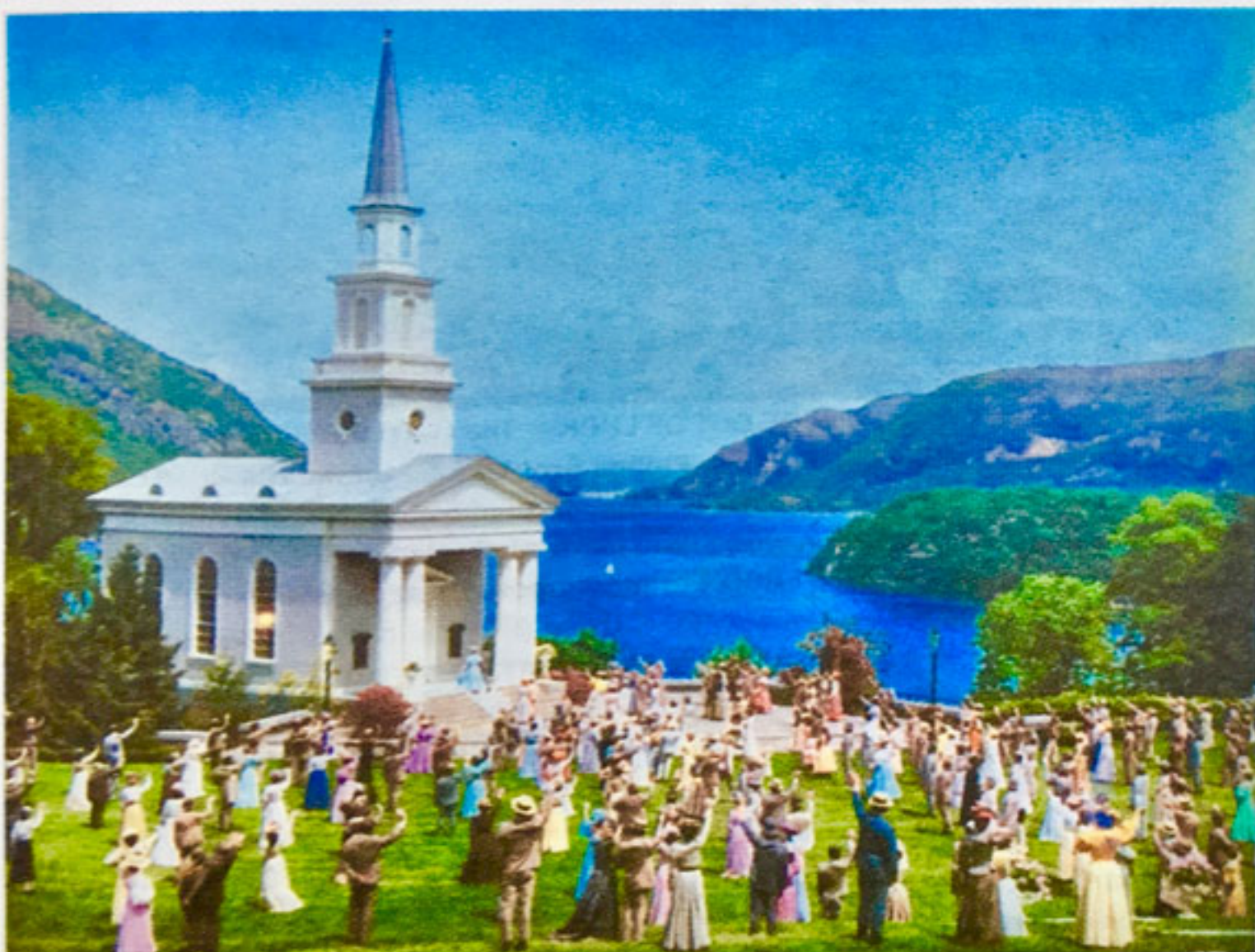
A scene was filmed at Trophy Point at West Point; the chapel was assembled in Garrison and flown over the river by helicopter.