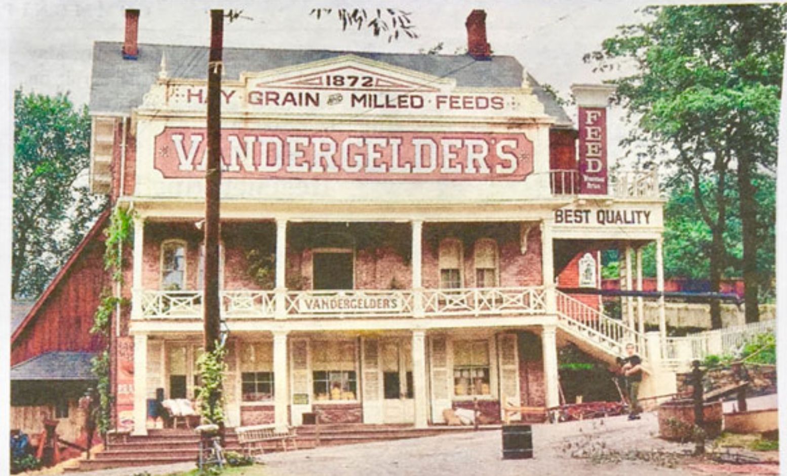
The Golden Eagle building at Garrison's Landing was transformed in 1968 into Vanderghelder's.

Also on display are Gene Kelly's copy of the script and other memorabilia, much of it provided by his widow,