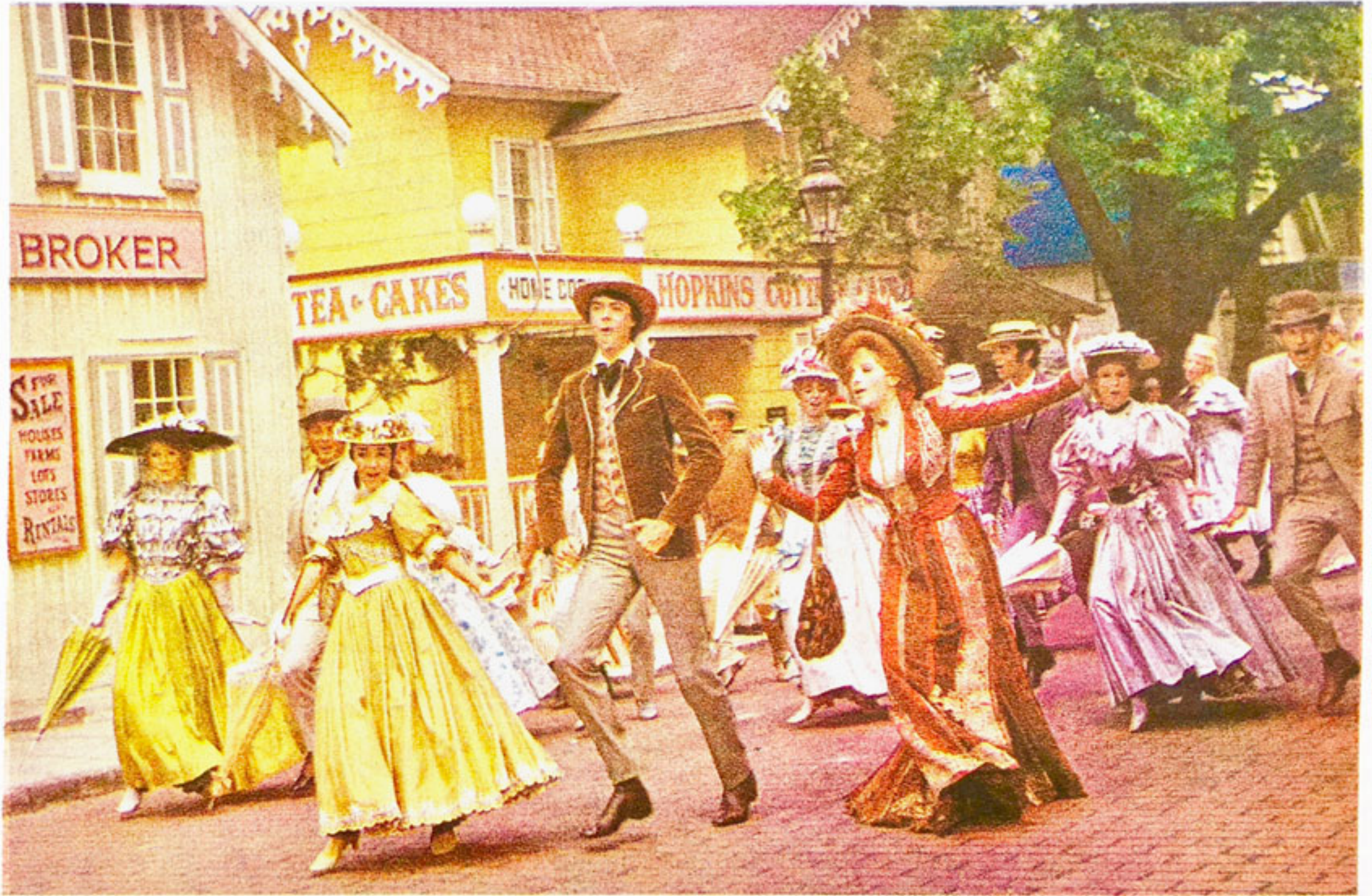
Tommy Tune leads the parade with Barbra Streisand on a decked-out Garrison's Landing during filming in June 1968.

May 12, with the opening of an exhibit at the Putnam History Museum in Cold Spring that looks back at the film's influence on Philipstown, West Point, Peekskill and Poughkeepsie, all of which hosted the cast and crew or served as settings over the summer of 1968.